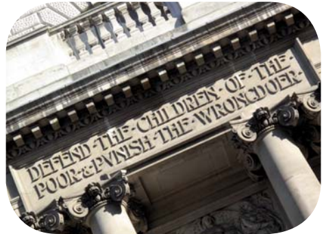
Inscription above doorway of the Old Bailey, London

Pray about plans to use digital technology throughout the UK justice system. These include 'virtual courts' and the secure electronic transfer of case files between the police, prosecutors, defence counsels and courts, to increase efficiency and prevent duplication.