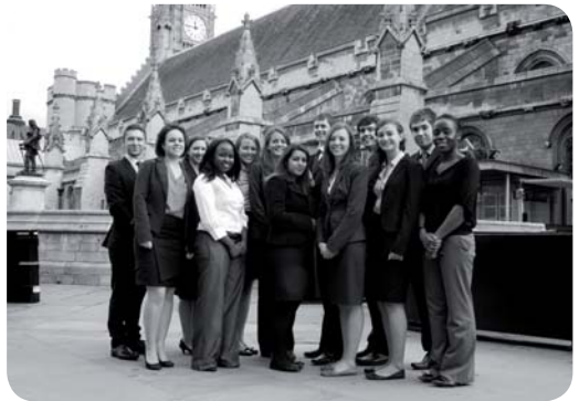
CARE Leadership Programme participants 2011-12

Remember the thirteen graduates on CARE's Leadership Programme on their placements with MPs and NGOs, who meet weekly for study, lectures, prayer and other input that inspires and equips them to relate their faith to effective engagement in society.